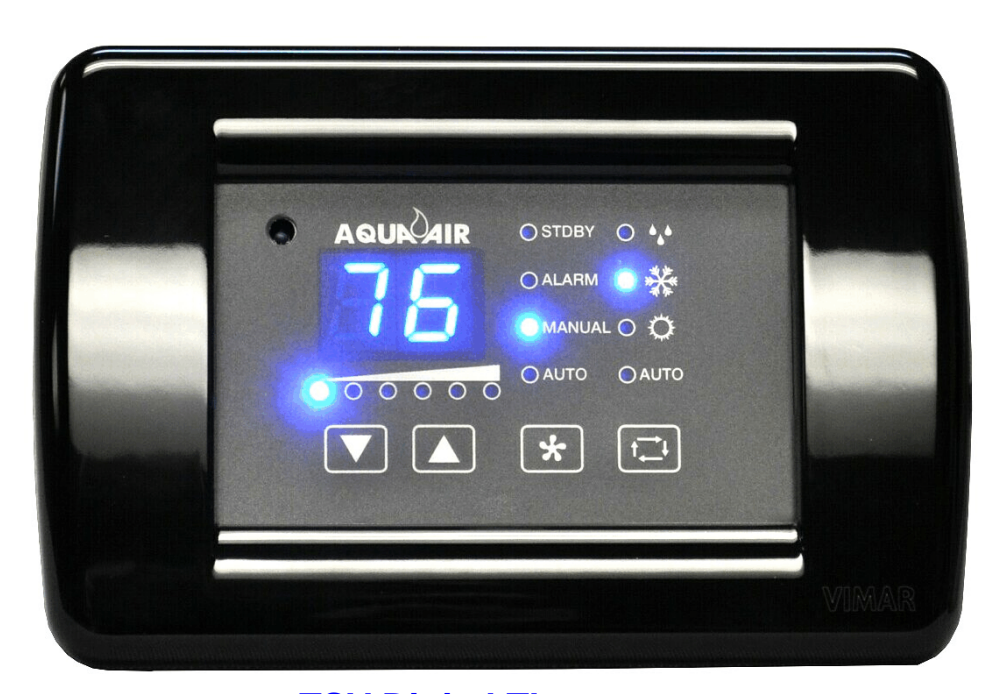
TSV Digital Thermostat with Black Vimar Bezel Actual Size

Aqua-Air Manufacturing, division of the James D. Nall Co., Inc. 1050 East 9th Street, Hialeah, Florida 33010 U.S.A. Ph. 305-884-8363 Fax 305-883-8549 E-mail sales@aquaair.com