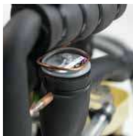
Thermal expansion valve increases performance for all conditions.