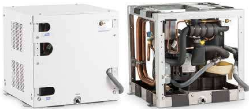
EI540X shown with and without cover panels

Titanium Durability & 540 lbs/245 kg Of Fishbox Ice Per Day