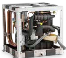
Ventilated cover panels can be removed for service access from any side.

The EI540X system installation kit includes one electrical box with Smart Logic keypad/display, water filter, and 35 ft/10.6 m of 0.75 in/20 mm ID ice delivery hose and insulation. This smaller diameter hose is easier to install and less likely to kink. Units are available in 115V/60Hz, 230V/60Hz, and 220V/50Hz electrical configurations. The EI540X will support an additional remotely-mountable Smart Logic keypad/display, which can be purchased separately.