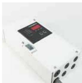
The easy-to-use Smart Logic digital control can be mounted remotely.