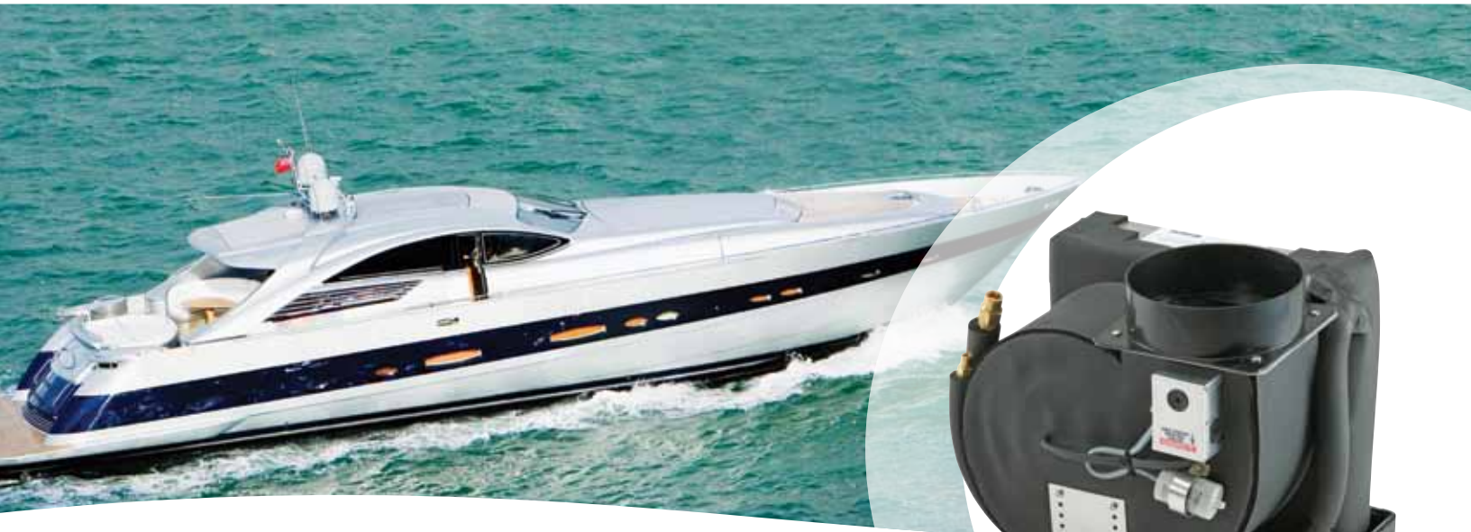
REU16 Evaporator shown

Cruisair's REU Series evaporators are draw-through, ductable cooling units with rotatable, variable-speed blowers. Featuring high-efficiency blowers, REU series units are available in capacities from 7K to 36K BTU/hr. Electric heat is standard on RHEU models (7K to 16K BTU/hr.). REU units can be used with Cruisair R-22 or R-417A condensers.