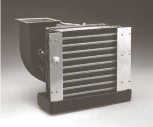
EBO16 Cooling Unit Shown