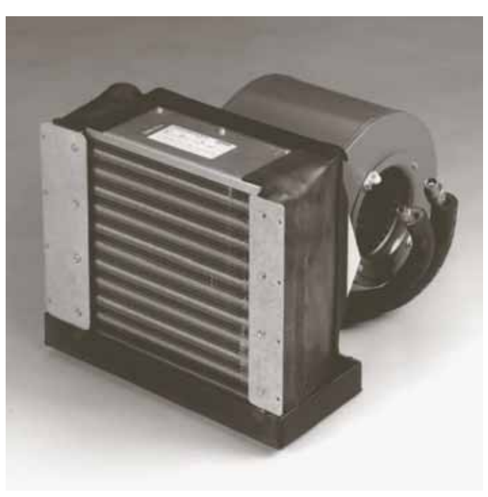
EBH16 Cooling Unit Shown