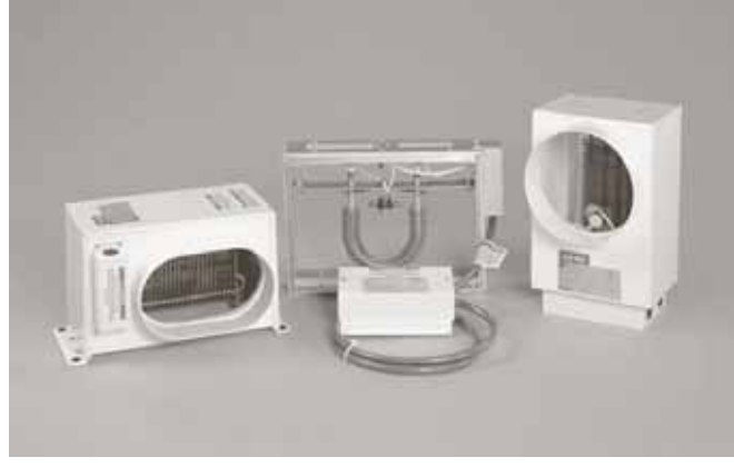
HMDL2-7, HMH1 & HMBL2-7 Units Shown